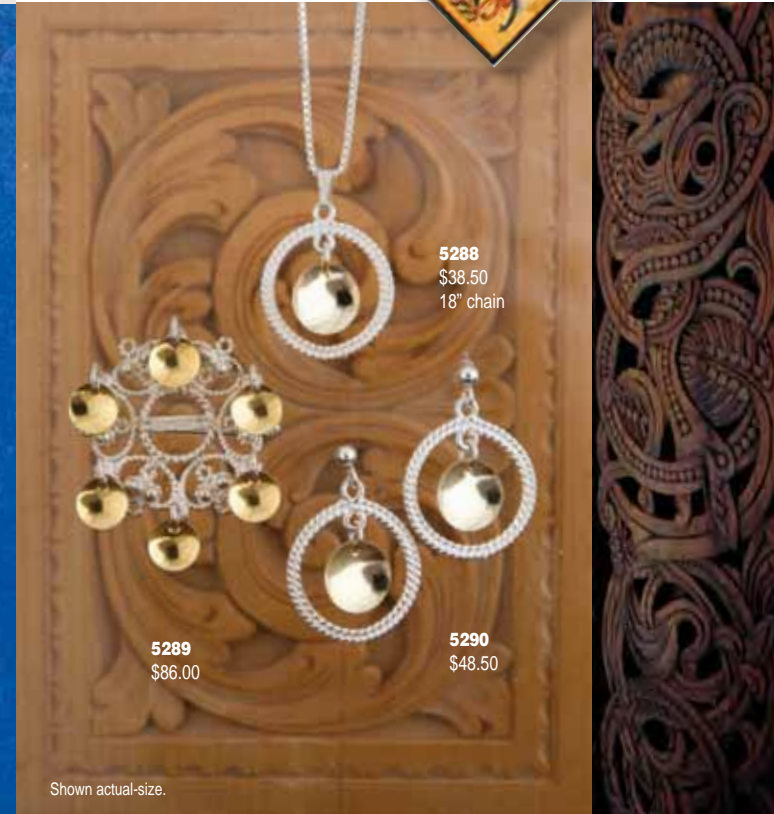
5288 $38.50 18" chain